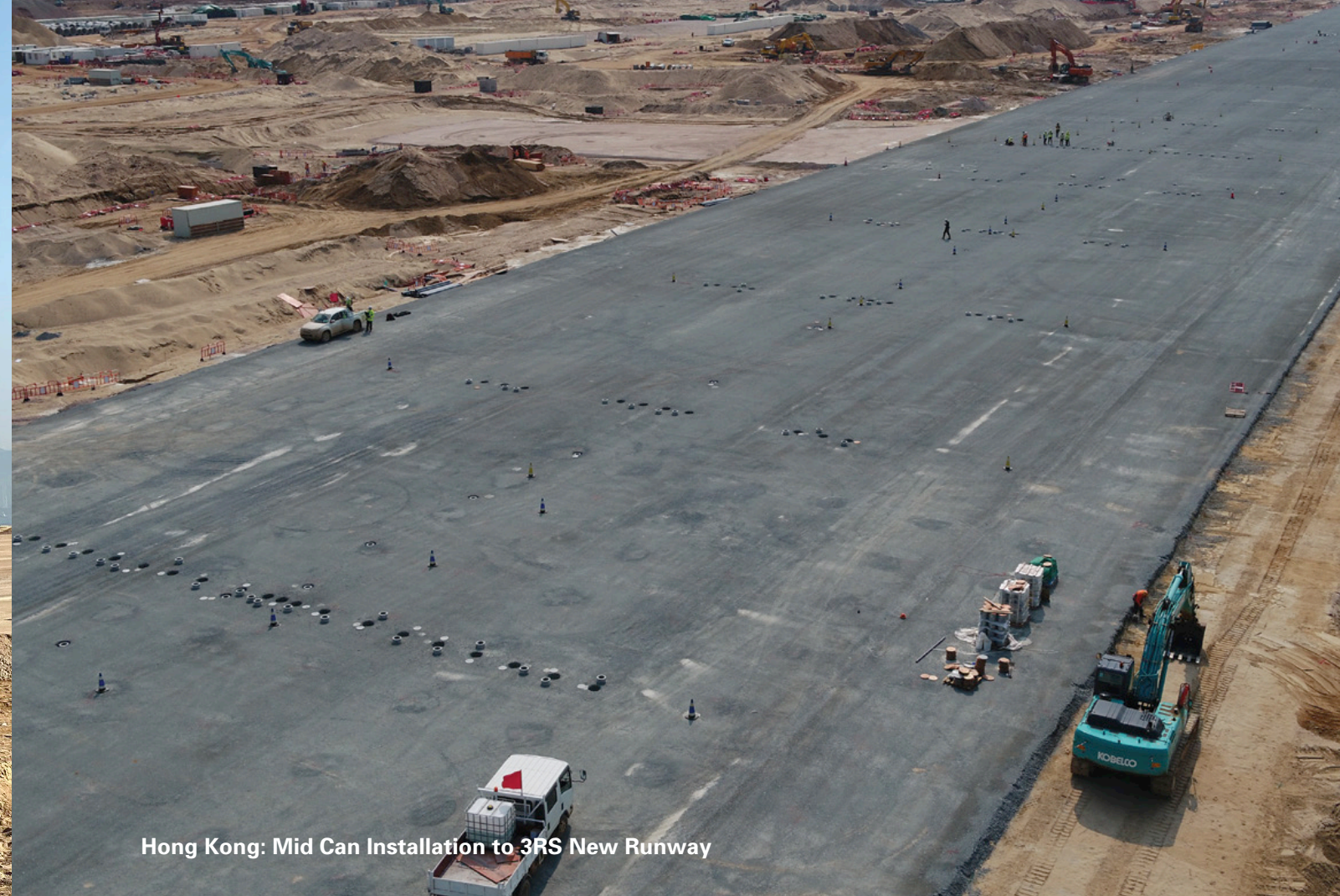
Hong Kong: Mid Can Installation to 3RS New Runway