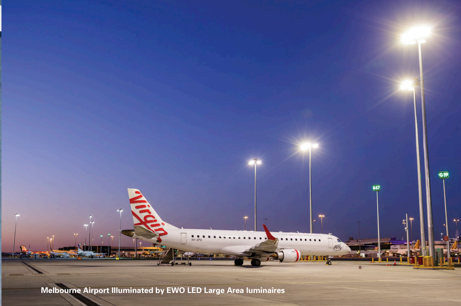
Melbourne Airport Illuminated by EWO LED Large Area luminaires