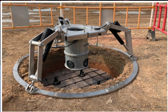
Avionics Self Levelling Jig